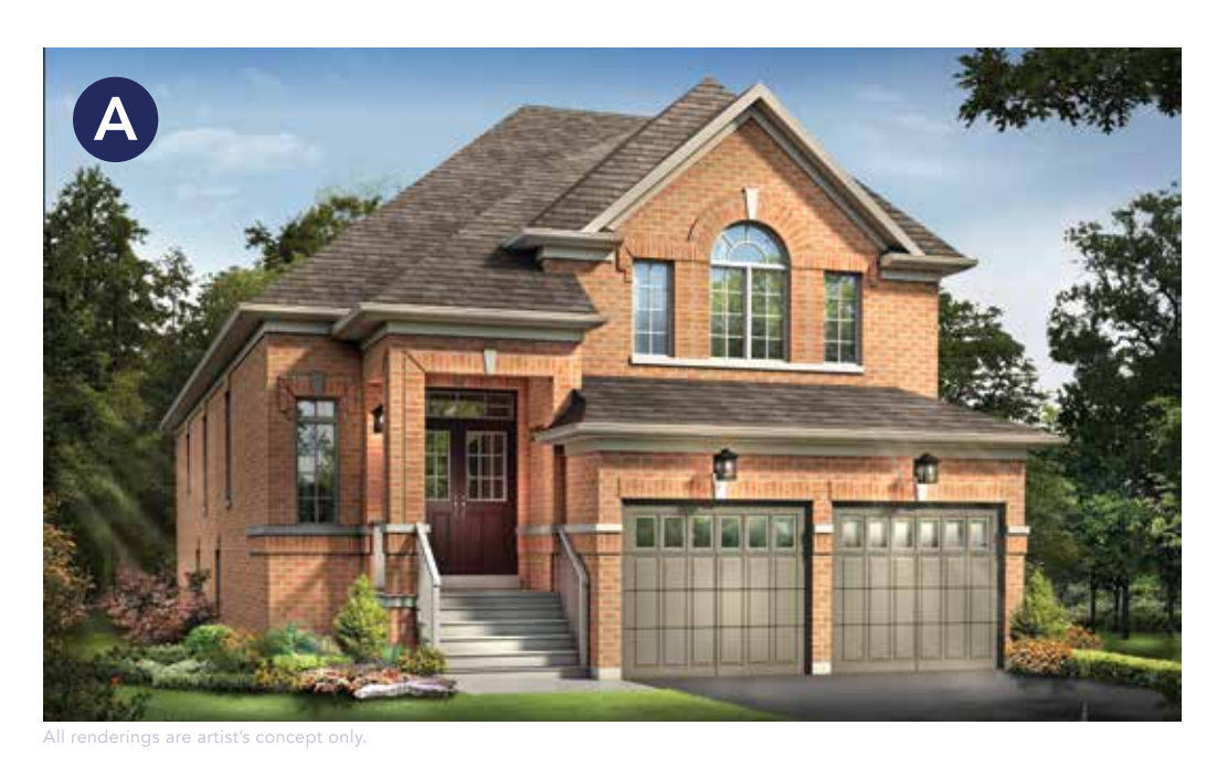
1516 sq. ft. WITH OPT. FINISHED BASEMENT: 2531 SQ. FT.