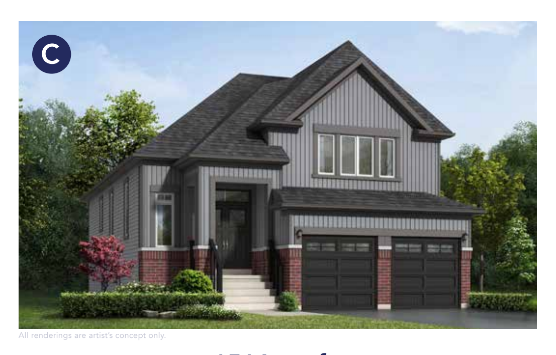
1516 sq. ft. WITH OPT. FINISHED BASEMENT: 2531 SQ. FT.